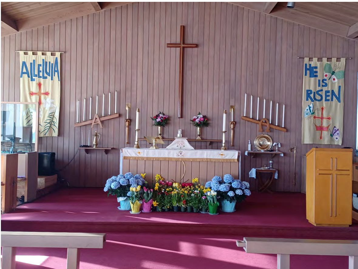
Our Sanctuary done up for Easter 2023. Thank you Chancel Guild !!